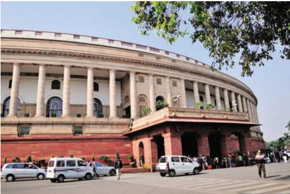
Why it's imperative for Parliament to move into a new building