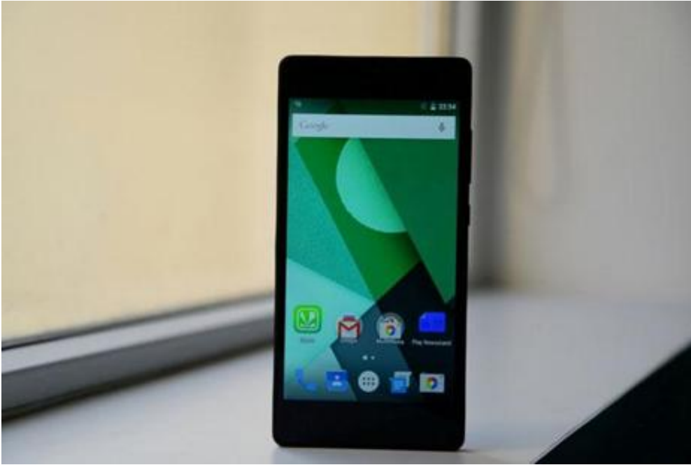
Review: Kult by 10 smartphone