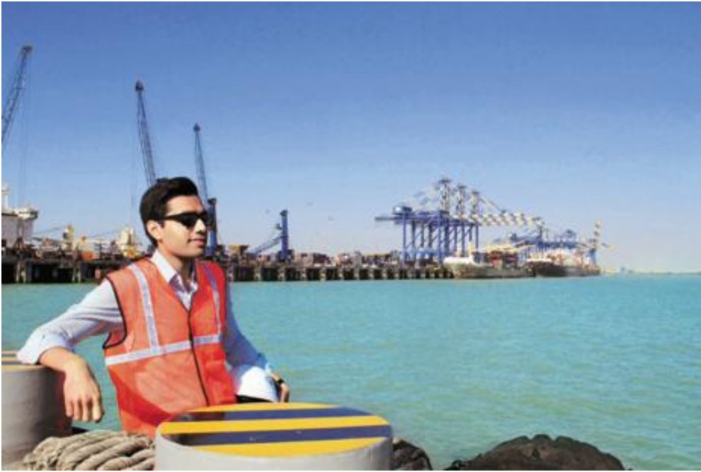
Gautam Adani's son Karan Adani takes over as CEO of Adani Ports