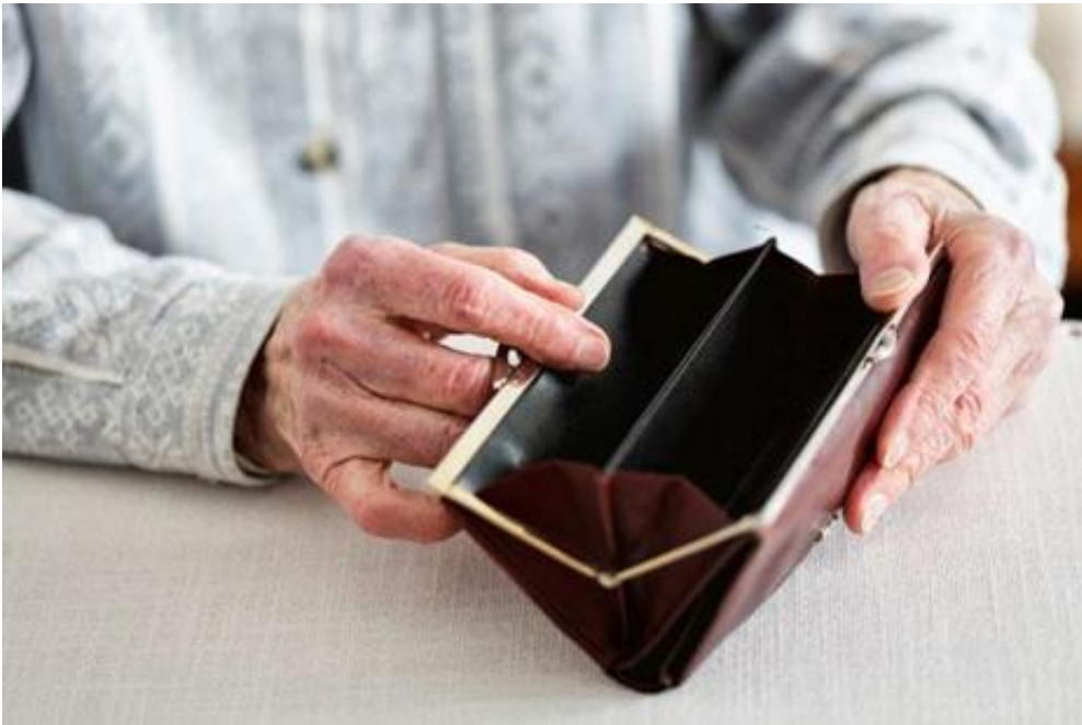
Poor and uneducated age faster