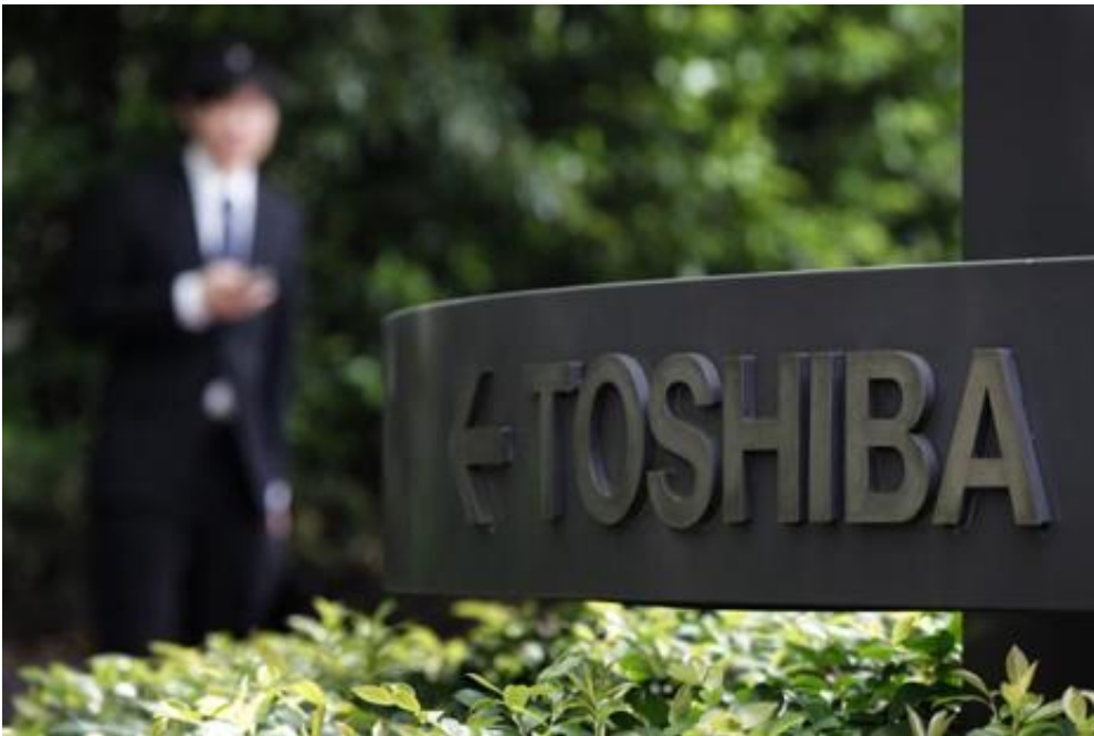
India deal unlikely to secure Toshiba's lofty nuclear plans