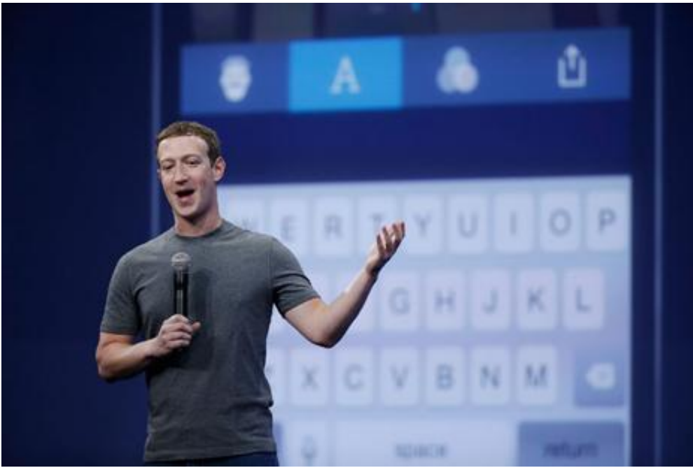
Mark Zuckerberg makes personal appeal for free Internet in India